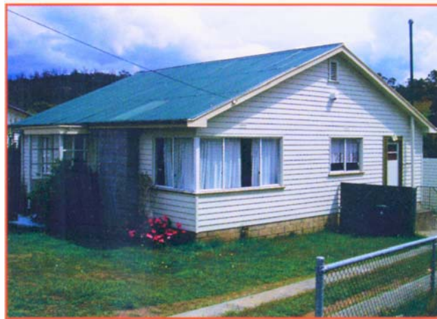
The U-Turn house in Warrane