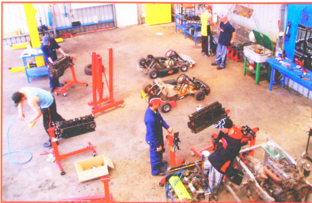
The U-Turn Workshop