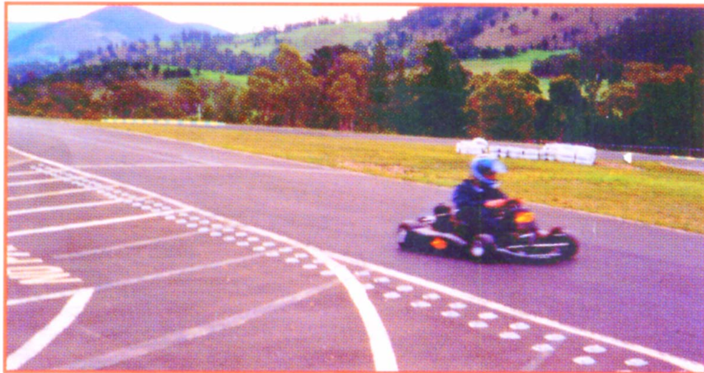
One of the U-Turn go-karts in action at Orielton.